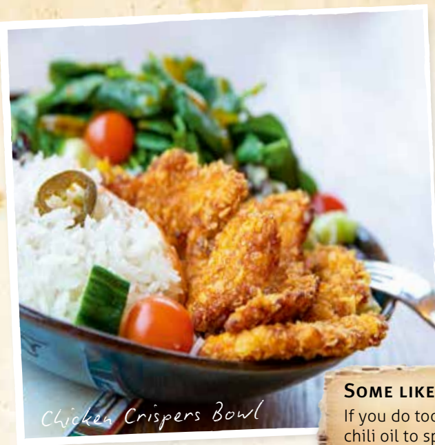
Chicken Crispers Bowl