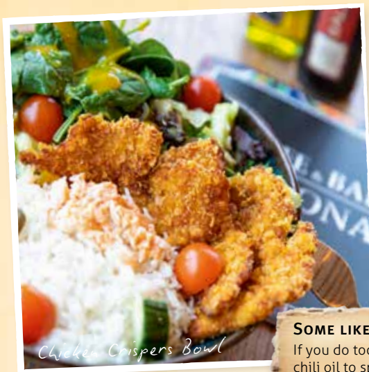
Chicken Crispers Bowl