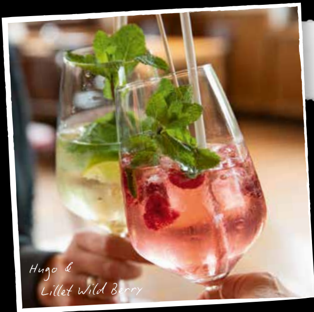
Hugo & Lillet Wild Berry